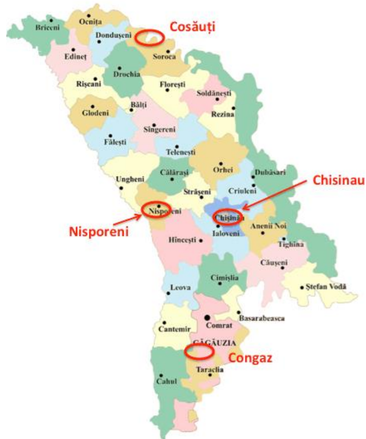
Figure 2: project